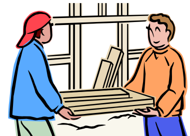
Create your own Exhibit Design