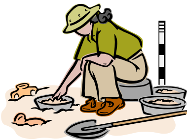
Learn how to preserve an artifact

GET A BEHIND THE SCENES LOOK AT THE MUSEUM VOLUNTEER FOR PROGRAMS AND SPECIAL EVENTS PARTICIPATE IN MUSEUM TRAININGS ATTEND BIENNIAL FIELD TRIPS RECEIVE NEWSLETTERS & EVENT INVITATIONS